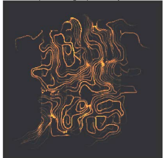
1 CE final output

We begin with a credit card number and from that we generate a linear barcode (as seen in figure 2) which then grows across a flow field. This flow field is created with a noise seed generated from an md5 hash of one of the 10,000 most popular passwords leaked online. This noise seed is generated by summing all the values of the ASCII characters. We realise that this can result in many values in the same relative area, but this is just a first attempt at a larger possibility.