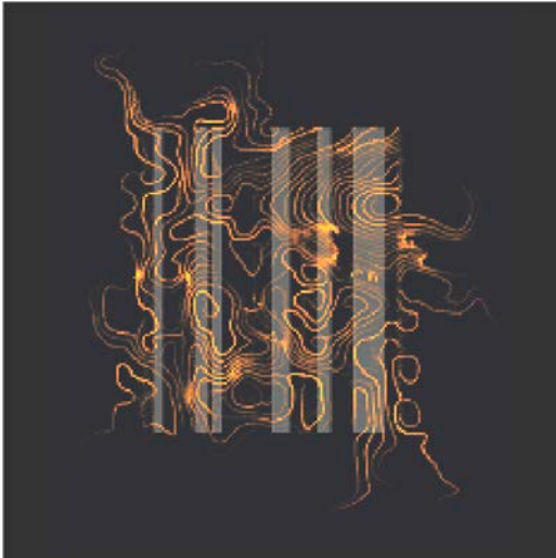
2 CE final output with barcode visible

We believe that in spite of the output being beautiful, but there is ample room for improvement as this is only a beginning.