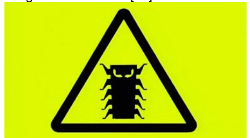
Figure 2: Millennium or Y2K bug, BBC News

Errors can be thought of in functional or technical terms. However, when we encounter them, we are more inclined to understand them in subjective terms, framed by control or our lack of over computers. In order to understand how errors shape our relationships with media we need to consider not only what causes them but how they are understood and what they represent. A ‘technological imaginary’ of the error perhaps. One that thinks of the error “in terms of its hardware and as a representation of cultural aspirations – imagined and actual” [13].