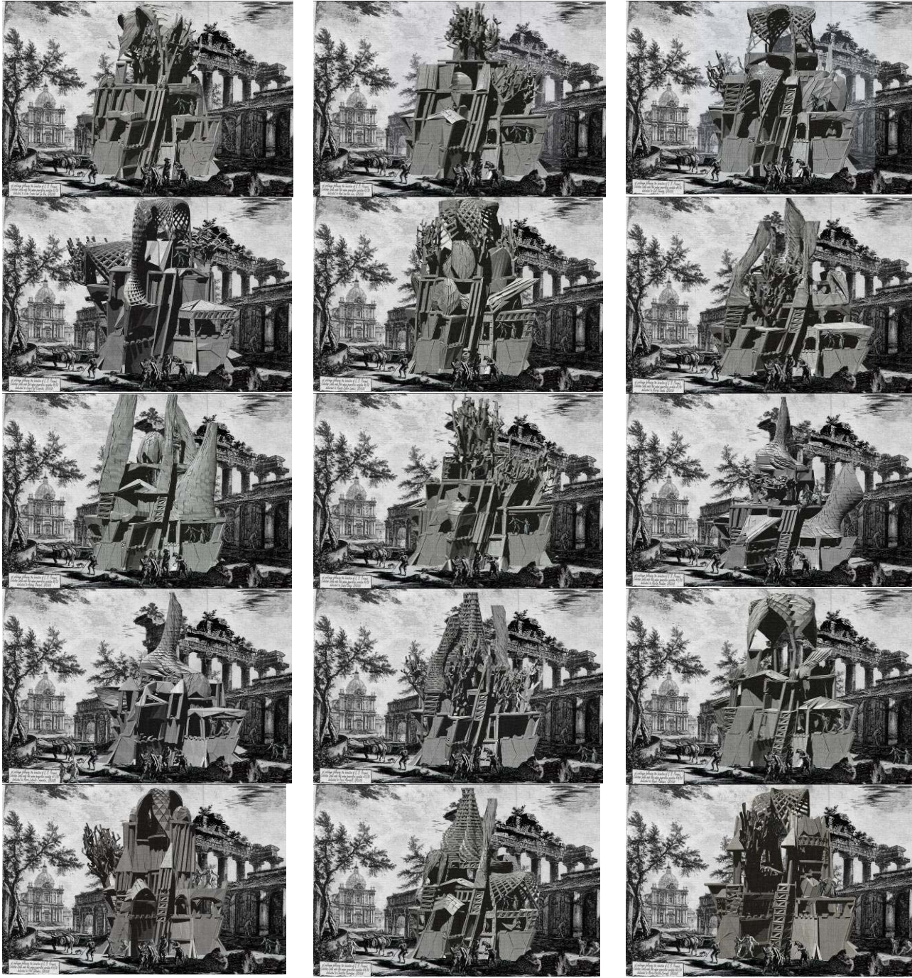
"The Babel Tower", This generative projecy was made generating 50 different unique Variations. The artworks were given to the 50 participants of GA2008 as gift of Celestino Soddu. In the image 15 variations.