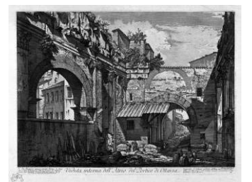
The original engraves of Piranesi representing the "portico d'Ottavia".

Inserting a generated architecture using codes from Borromini' and The Piranesi increasing complexity. C.Soddu, 2008