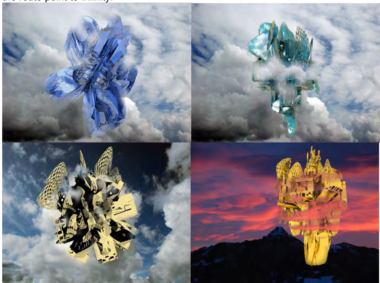
Flying Castles variations. The contaminations, the differences and the interpolations between parallel events create the complexity proper of counterpoint, produced by the dynamic progression through multiple interpretations based on sliding from a dimension to another. C.Soddu 2010.

An experiment made this year was the generation of "flying castles" based on hypercube geometry, or rather of multiple hypercubes that define the sliding through possible dynamic point of view, all progressively built on the dynamics of space / time from inside to outside and viceversa that is proper of hypercube. Each viewpoint has own different paths belonging to different dimensions and/or to the angular size of the route point-to-infinity.