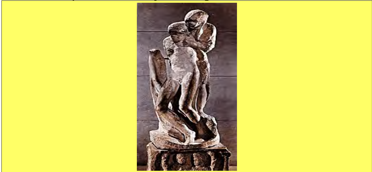
“La Pietà Rondanini”, Michelangelo

« The gratitude , and it only can induce us to the extreme sacrifice of the love to God and of the love to the men. The sense of the duty, of the obligations which we are kept, won't perhaps succeed in finding in itself the strengths to complete the last sacrifice of the life, of the offer and of the love. The gratitude instead yes, it finds them». Antonji Bloom