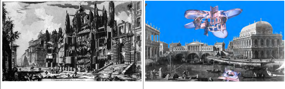
C. Soddu, Following Piranesi, Roma Acqua Felice, '08- Following Canaletto, Visioni barocche, '10