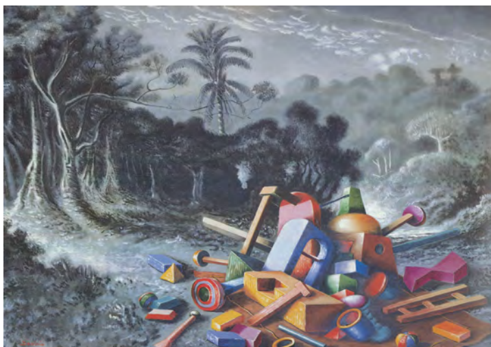
Alberto Savinio, Object dans la foret , 1927-1928

Structure: Historical significance – Similarity - Meta-characters in coding - Coplanarity - Representable in resurfacing - Fabula, te quaero - Imaginary cities - Ritornello . Exempla. The performing gratitude .