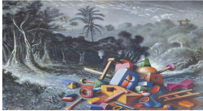
Alberto Savinio, Object dans la foret, 1927-1928

something in common with the variations, or with the variation of the variations of the representations. Like a polyphonic chorus they sing the common sense of the representation. The word representation it is intended in its primitive meaning of: making to appear ahead, therefore performing a re-evocation. Action of a subject on an object that implicates memory and time .