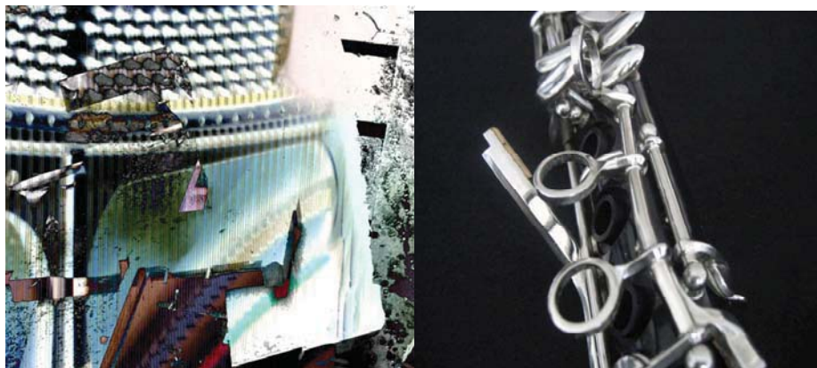
Image's of video stills from A Glimpse and High octane