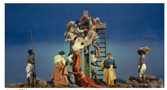
8 - Film sequences