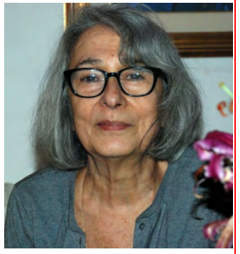
Topic: Generative Art Author: