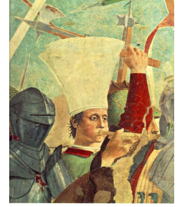
Piero Della Francesca, 5 self- portraits + 1

Keywords: poetic, logic, abduction, proverbs, variations, character/feature