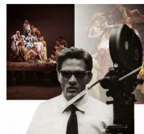
P.P.Pasolini on "La Ricotta set"

"The poetry language is an outside language. Its inside and permanent characteristic is the diachronic structure. The poetry time is the remote, the imperfect or the future time. The next past is impossible (as it is typical in the today's use of Italian): the present is possible as dramatization of the past, or rather as historical present. The present of the diary too, is not but a fiction: in reality, the same poet soul is in revocation. Shortly, poetry has to gain itself on the time myth: to stretch a veil of time on the things said, or past or future. In such diachronic structure, its tendentious meta-historicity can be conceived, otherwise as of a type ambiguously spiritualistic. You understand that its irrationality (what it is concretized in the time myth), such it is only apparently: it is not but a revocation or a logical elliptic prediction. The intuition is not but some jump of logical thought. That is why every poetic action or generically intuitive is always referable to a rational ideology.