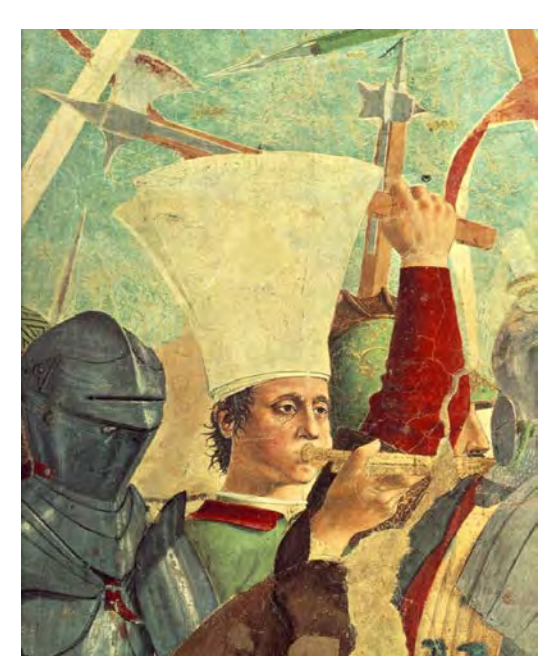
Flute Player in the "The battle of Eraclio e Cosroe"