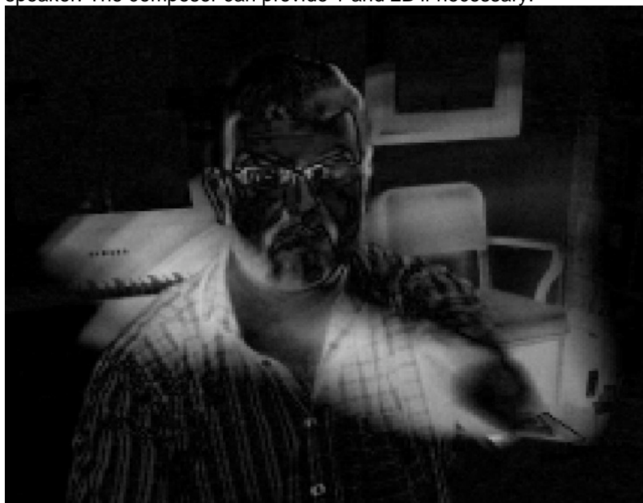
Example: Motion as detected by the software, to disrupt the flow of music

Technical requirements: 1) Computer with webcam and either 2A) Yamaha Disklavier piano and MIDI interface or 2B) amplifier and speaker. The composer can provide 1 and 2B if necessary.