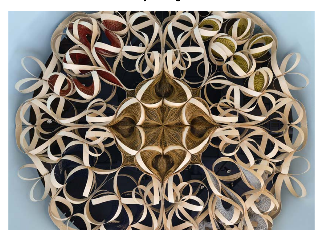
Figure 1: © M. Báez, Light Keeper, Circular Ceremonial Space