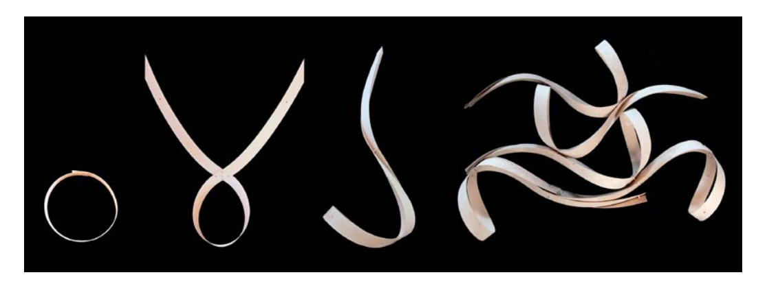
Figure 3: © M. Báez, Light Keeper , Generative process: Initial circular frame made from one birch-plywood band with the ends overlapped together with a central pivot. Additional bands are added and woven into the generative cellular unit. 5 of these units are shown in combination on the right.