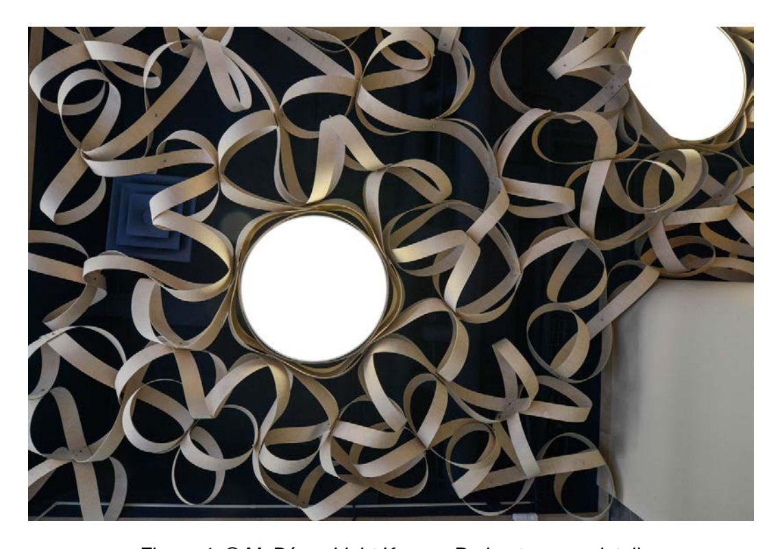
Figure 4: © M. Báez, Light Keeper, Perimeter area detail