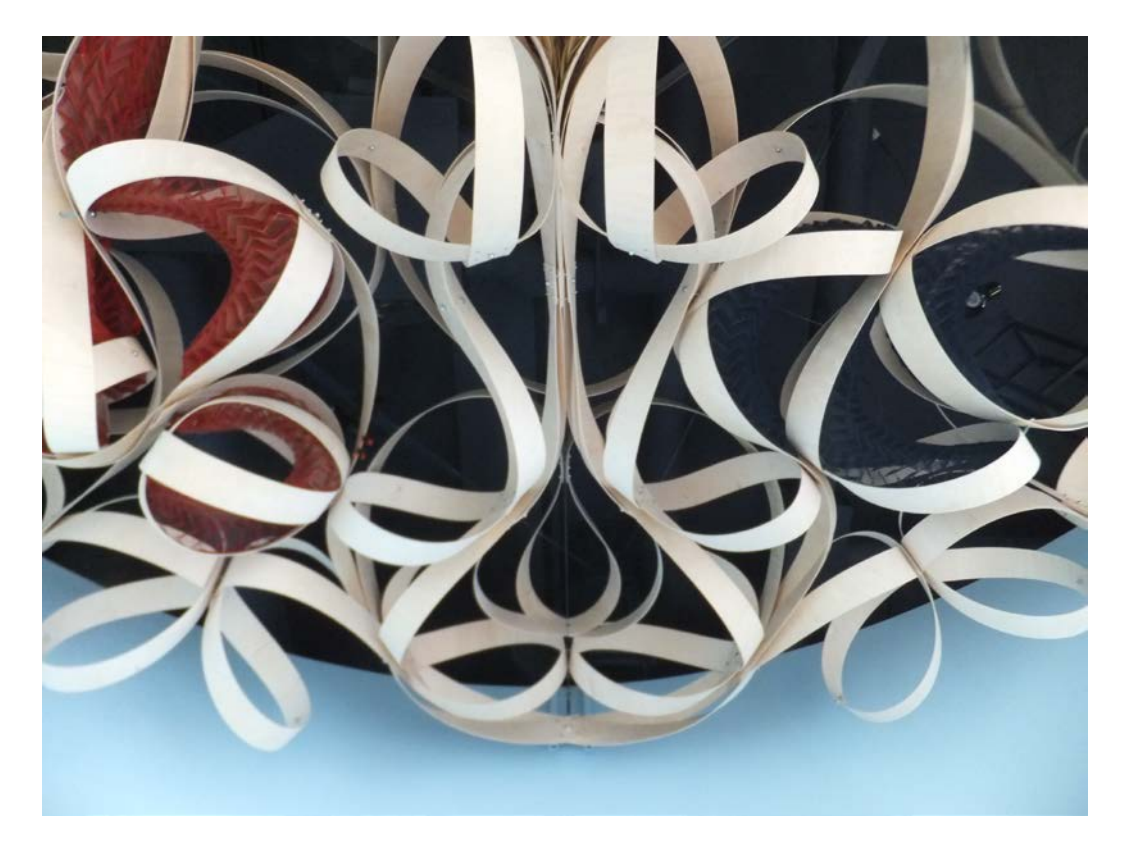
Figure 6: © M. Báez, Light Keeper, Circular Ceremonial Space detail.