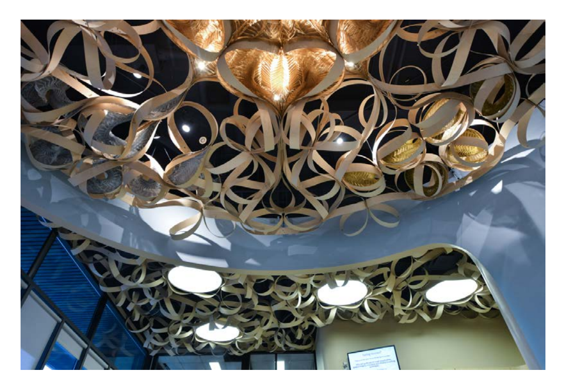
Figure 5: © M. Báez, Light Keeper , partial view, Ceremonial Space and perimeter area.