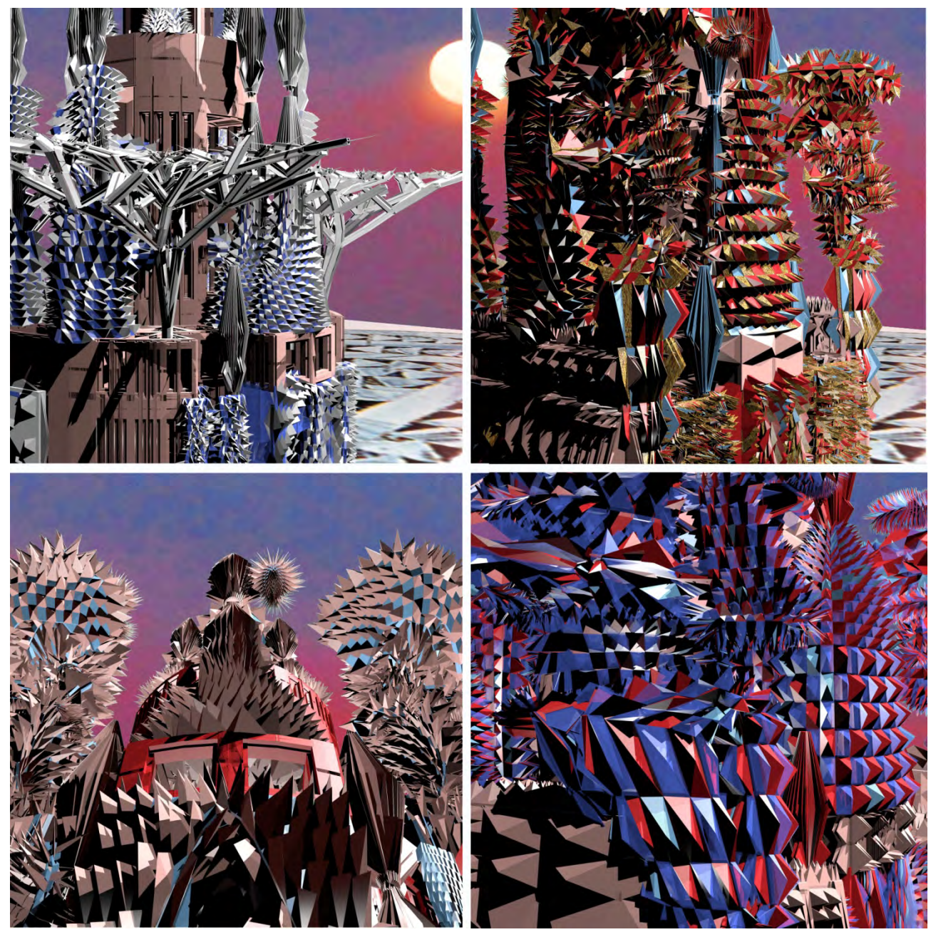
Details of mosaic-architectures designed for Ravenna. Generated "galleries" C.Soddu 2017.

But my idea of architecture is based on a three-dimensional space identity running progressively from details to the whole building. For me, the mosaic is a set of events whose diversity and identity is based on a strongly three-dimensional relationship with space. So, after several attempts, I chose a different but allusive way to of unveiling the potential identity Ravenna. I chose to create algorithms that perform the individual tiles so that they are sensitive to their location and spatial orientation. At the same time, I followed the concept of the mutual importance of rhythms, riffs and exceptional sequences in performing the space. I have done that for fitting my vision of architecture.