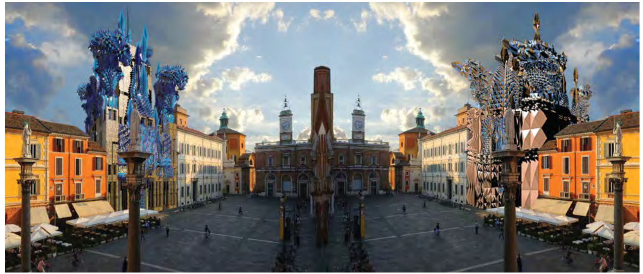
Two mirroring variations of Mosaic Galleries in Piazza del Popolo, Ravenna.

A generative idea ad hoc and, following, a generative focused technique was needed to build the recognizability that I was searching for. A creative path able to unveil the character based on my interpretation of Ravenna's urban identity and able to represent this idea.