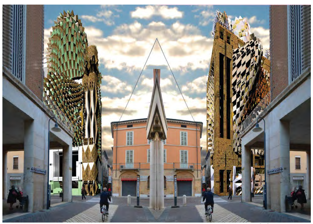
Two mirroring variations of generated architectures in Ravenna downtown. C.Soddu 2017