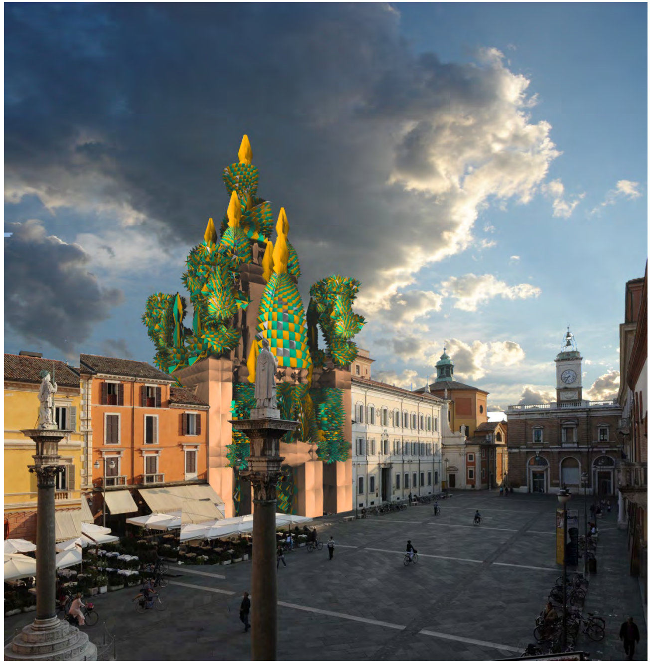
Mosaic-architecture in Piazza del Popolo, Ravenna. Variation 3. C.Soddu 2017

But this idea must exist. It cannot be derived from the tools, even by generative software created by others. It must be expressed a priori and pursued in developing the algorithms, transformation logic, topologies, and space bends that represent this idea before it becomes an achievable three-dimensional architecture.