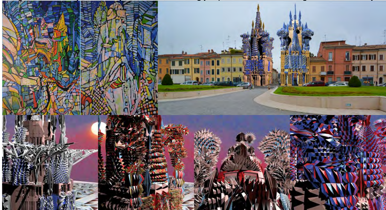
2 Oil Paintings, NYC Guggenheim Museum and NYC Brodway/5<sup>th</sup> ave, C.Soddu 1985 - Mosaic Architectures for Ravenna Identity in front of MAR - 4 Mosaic-Architectures details C.Soddu 2017

These generated architectures are, however, a three-dimensional mosaic. Every single tile is a three-dimensional event able to spatially reflect the light becoming an integral part of the total architectural image. This interchange between 3D events at small and large scale lights up a recognizable identity and, in my intentions, is strongly representative of futuring Ravenna identity.