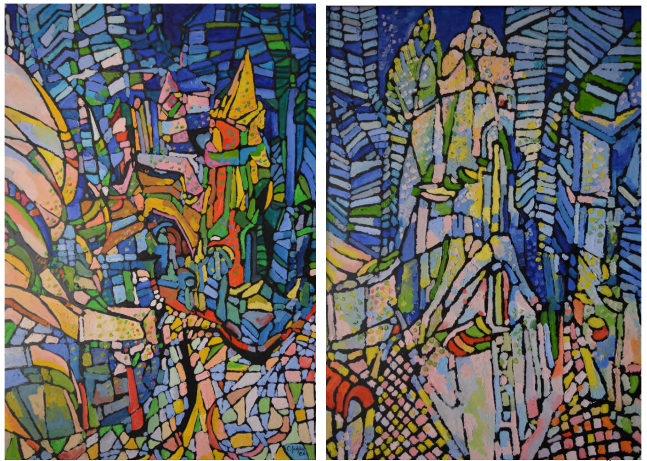
Two oil paintings, NYC, the Guggenheim Museum and Broadway crossing 5<sup>th</sup> ave. C.Soddu 1986. The like-mosaic structure and the curved space representation is explicit and it is a constant of my work.

The geometric control system of the totality has always been, since the early years of my creative activity, strongly oriented towards the non-Euclidean representations of the 3D space where it was possible to identify multiple observation points with progressive dynamic rotations but also multiple vanishing points of single bundles of parallel lines.