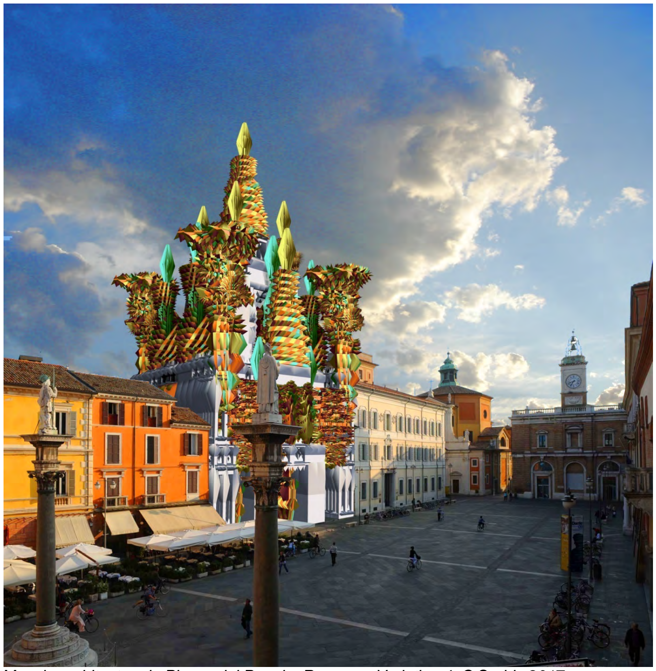
Mosaic-architecture in Piazza del Popolo, Ravenna. Variation 4. C.Soddu 2017

Generative Art is the art, understood as skill, to build processes capable of generating results representing the vision of an artist. The artwork is the generative process.