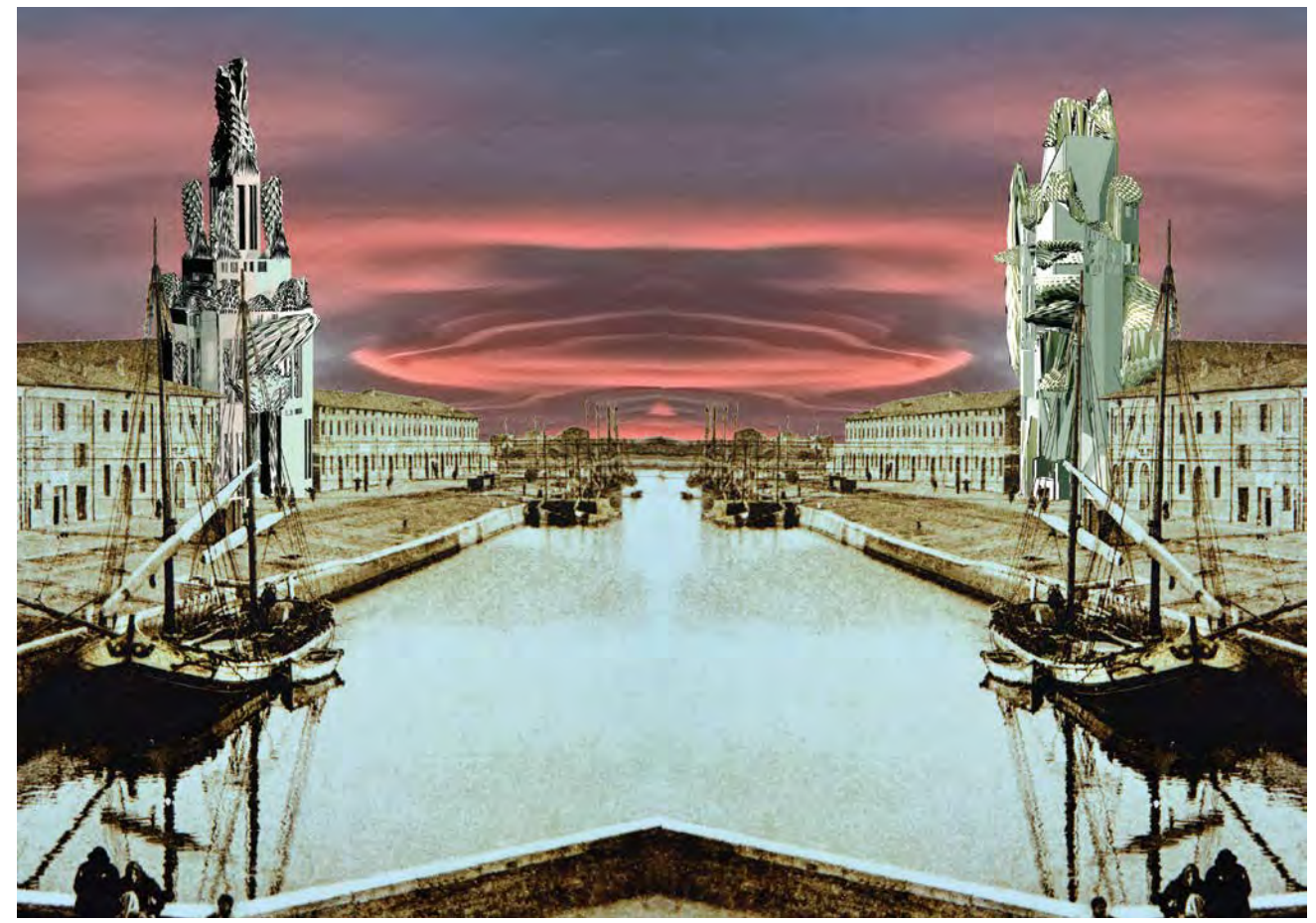
Two mirroring generated Mosaic Architectures in the ancient harbor of Ravenna, C.Soddu 2017

All books are for free download at www.artscience-ebookshop.com