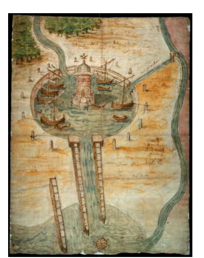
The ancient harbor of Ravenna