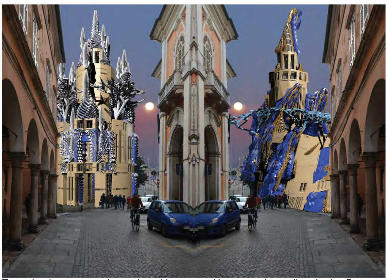
Two mirroring generated mosaic-architectures with a central paradigm in the Ravenna downtown. C.Soddu 2017.

My final images seem to be, I know, a little dark. But the shadows are essential to communicate the space structure. I like Caravaggio for the smell of infinite space around the lighted images, also if I like Giotto too, with no shadows, for his strong visionary way to show his medieval cities by using non-linear sequences of dynamic points of view. (the book "L'immagine non Euclidea", C.Soddu, Gangemi Publ. 1986)