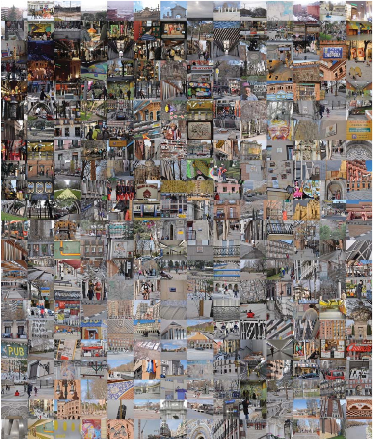
3. General cartography. Image created from database of 900 photographs, using a freeware computer programme and image captured by satellite (Google Maps, district of Madrid).