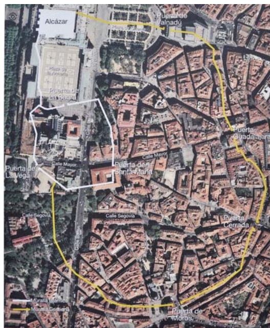
Traçado hipotético das muralhas islâmica e cristiana sobre o mapa atual de ruas