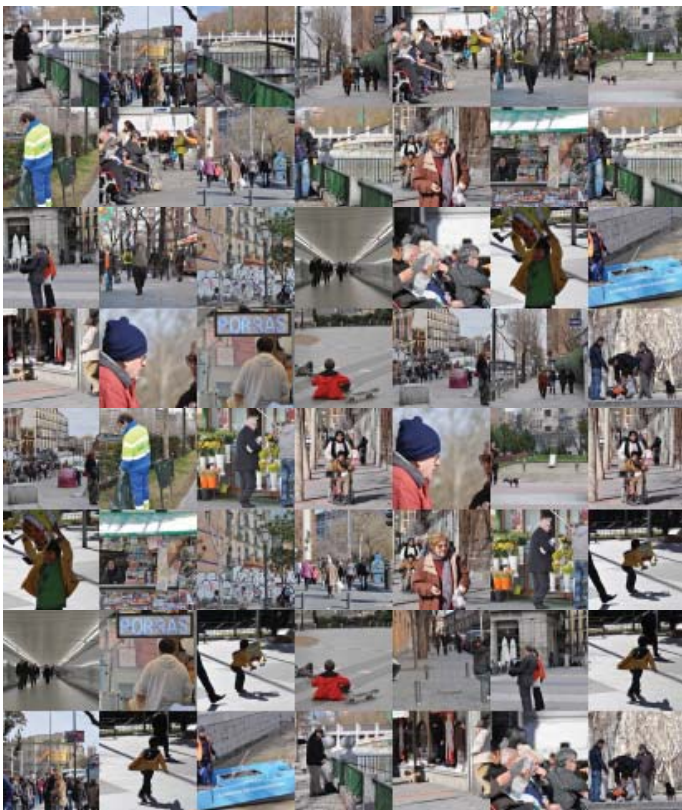
5. People cartography