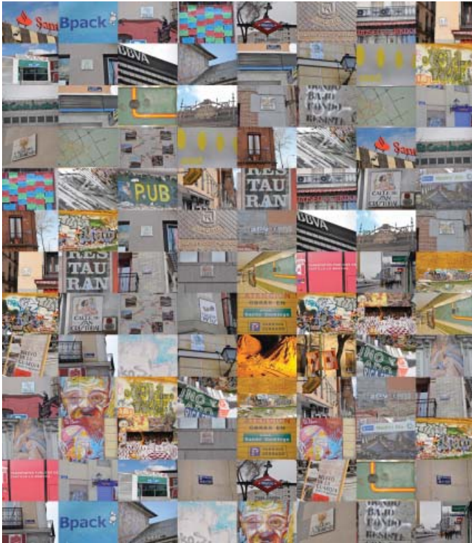
4. Sign cartography