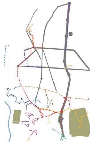
Image created from 900 photographs, using a free software and an image captured by satellite (Google Maps, district of Madrid). Map of the routes traversed.