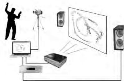
schema sistema PAGE

During the 90's my research activity on Visual Art led me to focus attention on computers which were becoming more and more powerful, affordable and usable. I wanted to verify whether this new "electronic device" could satisfy my needs toward a new approach to digital art. Thanks to the collaboration with Computer Music Lab of CNUCE/C.N.R (today "computerART Lab of ISTI/CNR, A.Faedo Institute, National Council of Research - Pisa).