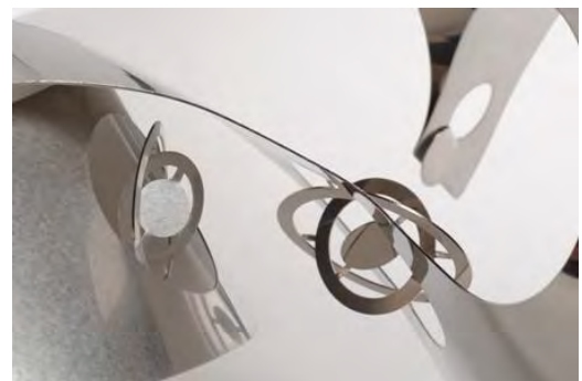
Nameless II Detail